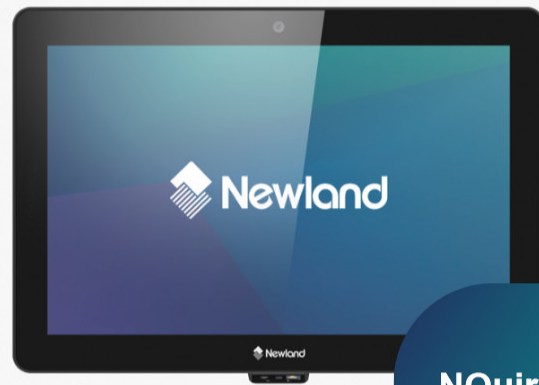
NQquire 1000 Manta III Micro Kiosks